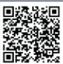
Parent Connections 4/6/22

FOR MORE INFORMATION: CONTACT US AT WORKFORCE.RESA.NET