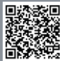
Career Chat 2/9/22