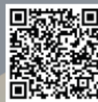
Career Chat 3/16/22